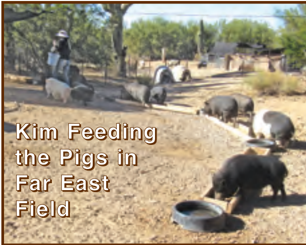
Kim Feeding the Pigs in Far East Field

hourly rotation of pigs in and out of the exercise yards for their daily turns to come out and explore.