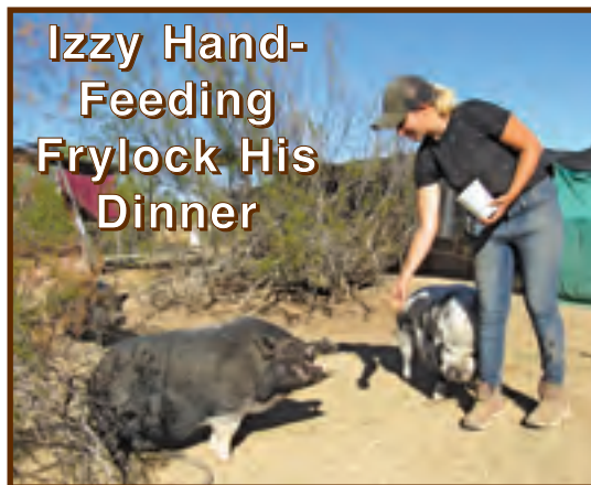
Izzy Hand-Feeding Frylock His Dinner

After the feeding and watering teams have completed those two activities which take up the majority of the day, there are plenty of chores to keep them busy. Supplies have to be inventoried and ordered weekly. Packages of donations must be opened, recorded and put away. There are always medical issues to deal with...medicating