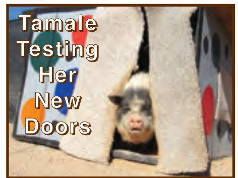
Tamale Testing Her New Doors

taken for sponsor updates, newsletters and social media. Pigs living in the holding pens that we're attempting to integrate into social groups have to be