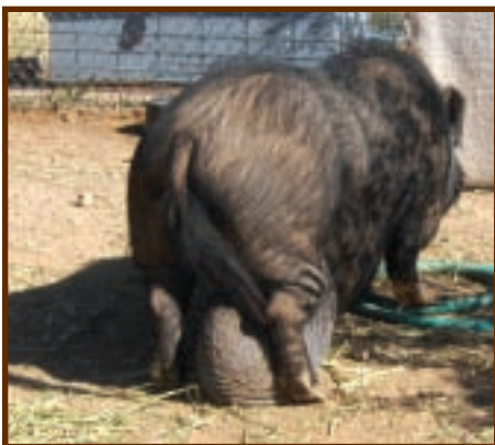
Twix On His Arrival

T he calls continue to pour in from people who have lost their homes and need to place their pigs. Not an easy thing to do for an adult pig and certainly not for Twix and his sister Hopper who are 2-1/2 years