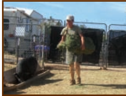
April Putting Out Hay

the pigs living in the pens and in the yards behind the houses. Off they go in different directions with tubs filled with meds and meals. Parts of the fields are easy with the pigs eating in troughs but then there are always pigs everywhere that need to go in