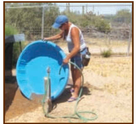
Beth Cleans a Wading Pool

During the summers our water well cannot pump enough water to keep up with the demand so Ben must make trips to town with the water truck to replenish the water tanks.