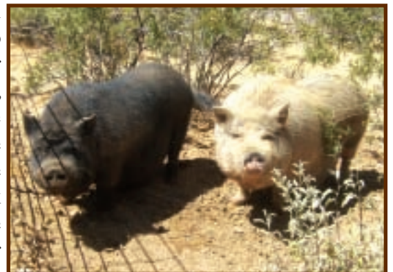
Twix & Hopper Reunited

We never wish people ill and certainly don't like to hear that yet another pig owner has lost their home and thus the pig or pigs have lost their home as well.