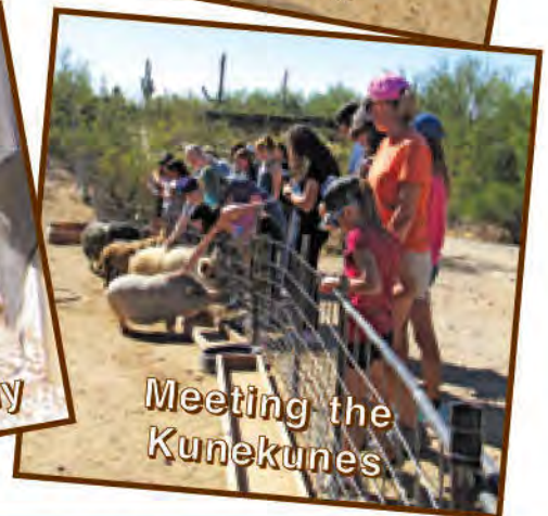
Meeting the Kunekunes