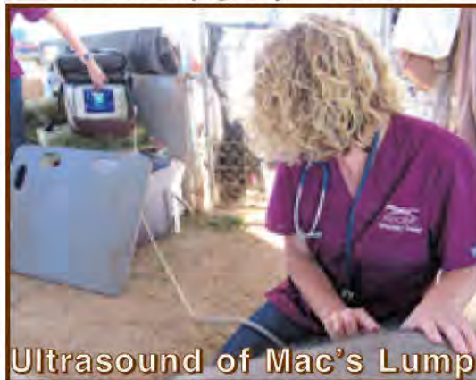
Ultrasound of Mac's Lump

Iris' conjunctiva was redder than normal and wanted that checked. The two lazy girls just continued