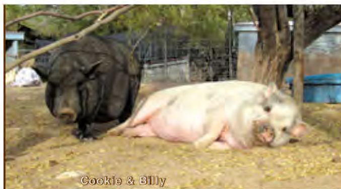
Cookie & Billy