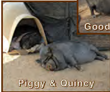
Piggy & Quincy

enough to push in and out of the door. Oh well, come spring the other pigs will start sleeping outside again. In the meantime, I plan to keep jogging to stay in shape.