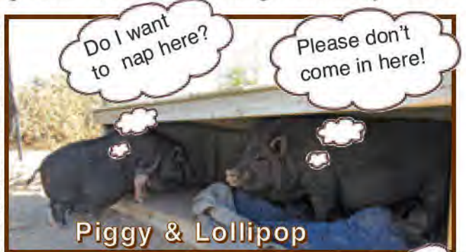
Piggy & Lollipop

pigs before, so they want to pet us a lot, especially since we're the last stop. It's like, last chance to hang with pigs, hurry and pet us all! Well, except my buddy Shaq. He's kind of weird about being petted. He likes it but only 2 or 3 pats and then he's done. I mean really done...he'll snap at people to make them stop. I would never, ever do that! Just keep it coming! If you ever come here to visit the pigs, be sure to stop by Lil' East and look me up. I might be resting from my latest