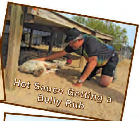
Hot Sauce Getting a Belly Rub