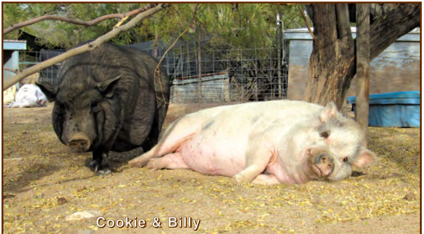
Cookie & Billy