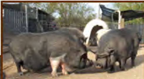
Good Morning Quincy

because nobody sleeps outside anymore and all the houses have carpet doors on them now. That makes it harder to dart in and scare everyone when I have to slow down